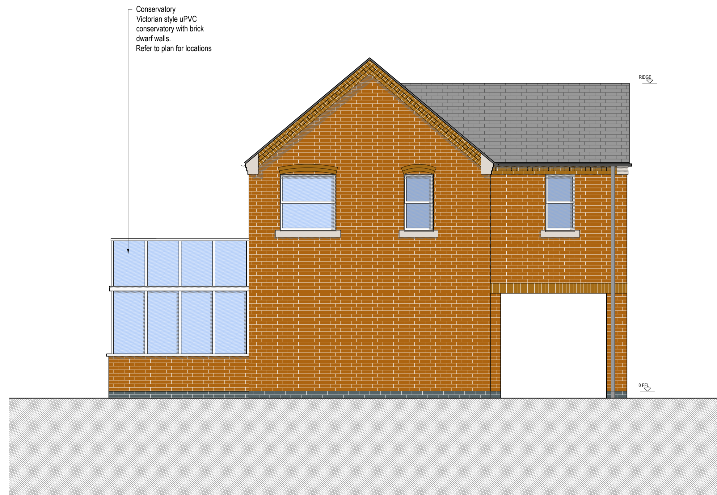
C Rear Elevation