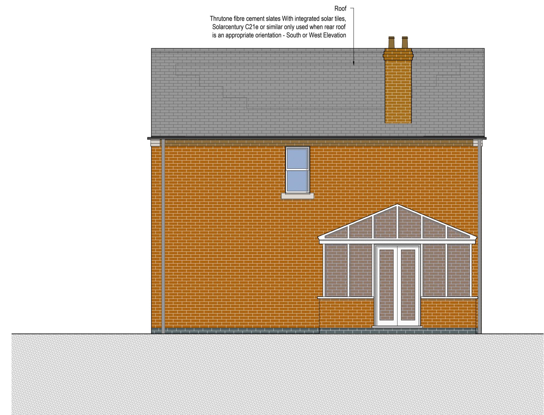
D Side 2 Elevation