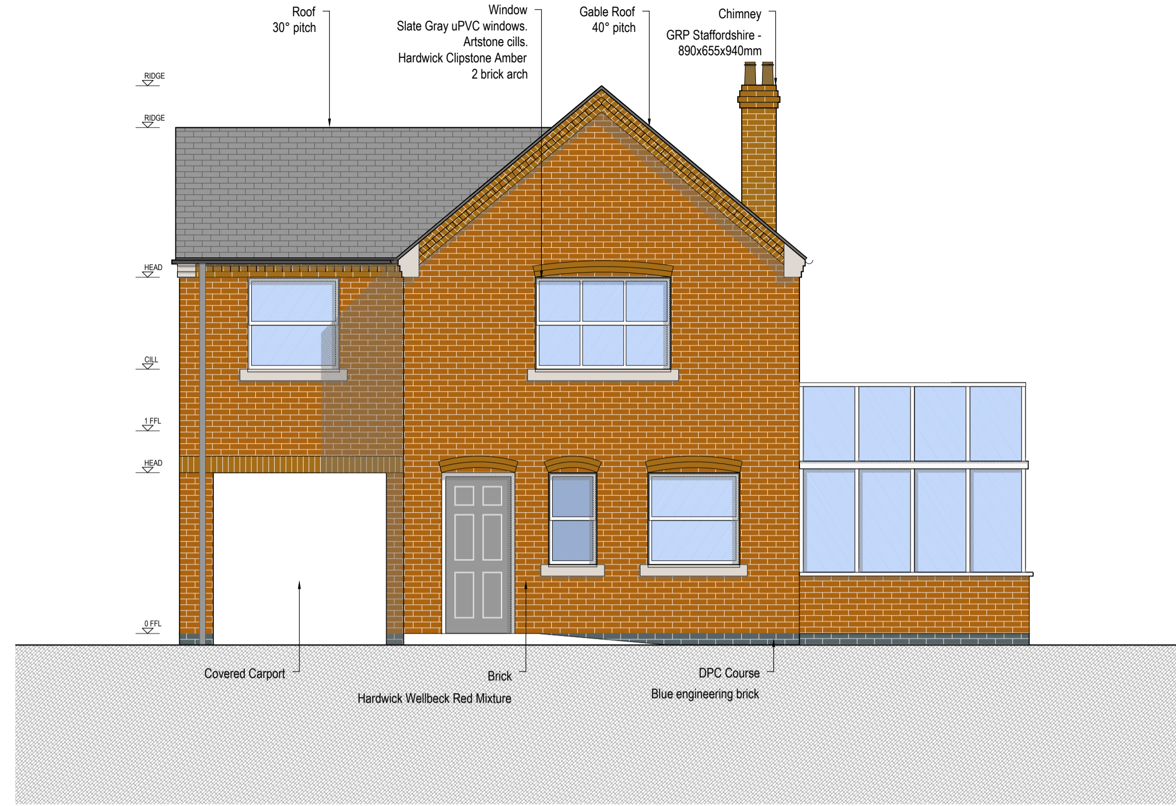
A Front Elevation